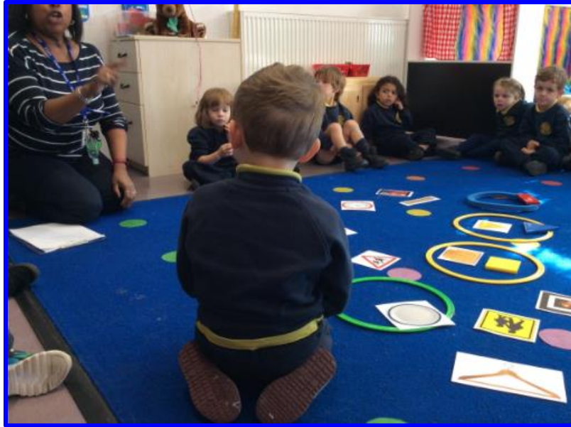
Nursery have been exploring features of shape to sort.