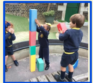
Kylah builds a tall tower.