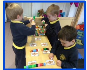
Huxley, Charles and Teddy match quantity to numerals.