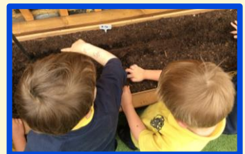
Planting tiny radish seeds.