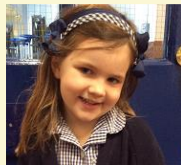
RPY – Willow