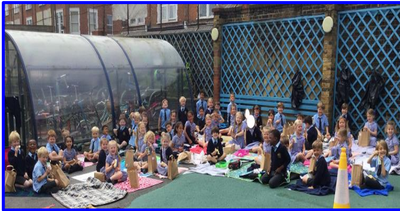
Reception loved their picnic this Friday!