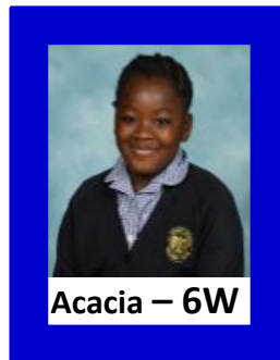
Acacia – 6W