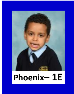
Phoenix – 1E